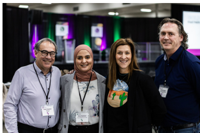
Exhibit spaces are also available for Agri-Food Innovation Expo 2024. Please see our website to learn more about how you can showcase your brand and products by purchasing an exhibit space.