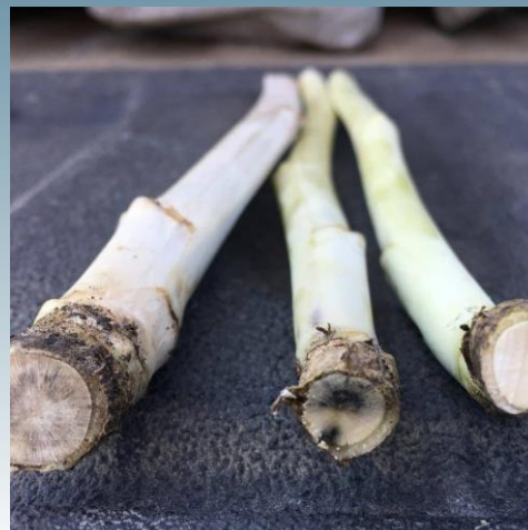
Root cross-section of plants prior to harvest. Verticillium stripe (left), blackleg (middle), and healthy plant (right)

https://www.canolacouncil.org/canola-encyclopedia/diseases/verticillium-stripe/